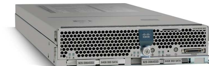
Figure 1. Cisco UCS B230 M2 Blade Server

The Cisco UCS B230 M2 is a half-width blade (Figure 1). Up to eight of these high-density two-socket servers can reside in the six-rack-unit (6RU) Cisco UCS 5100 Series Blade Server Chassis, offering one of the highest densities of servers per rack unit in the industry.